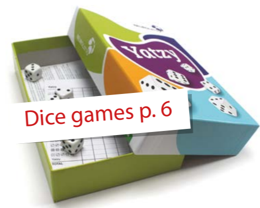
Dice games p. 6