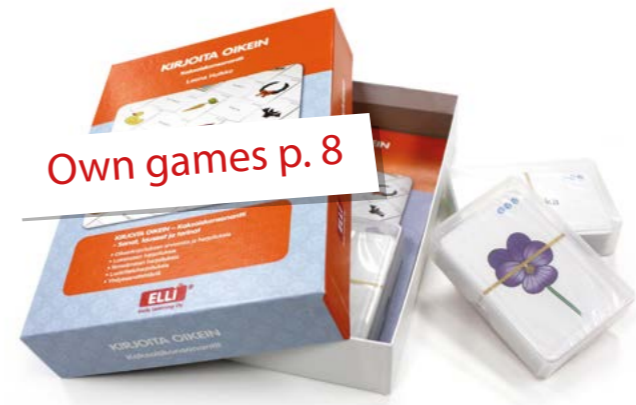
Own games p. 8