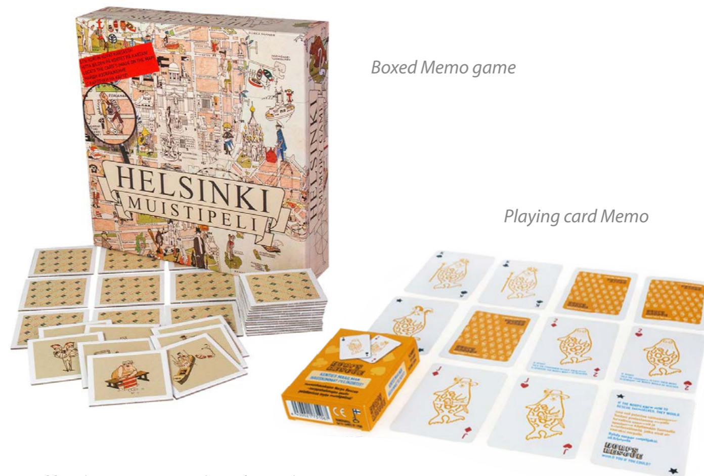
Boxed Memo game