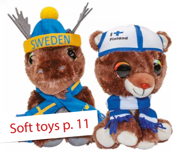
Soft toys p. 11