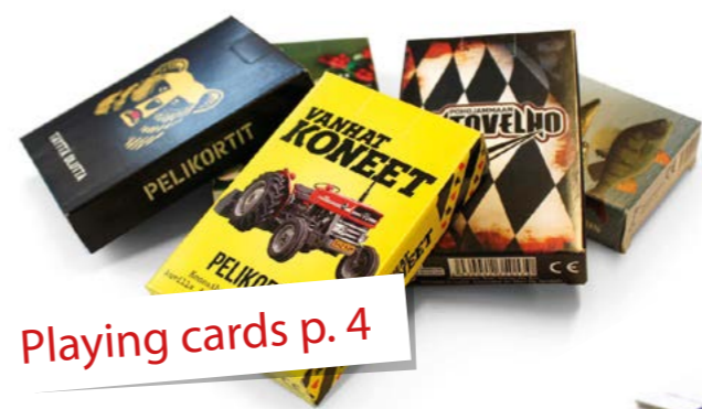
Playing cards p. 4