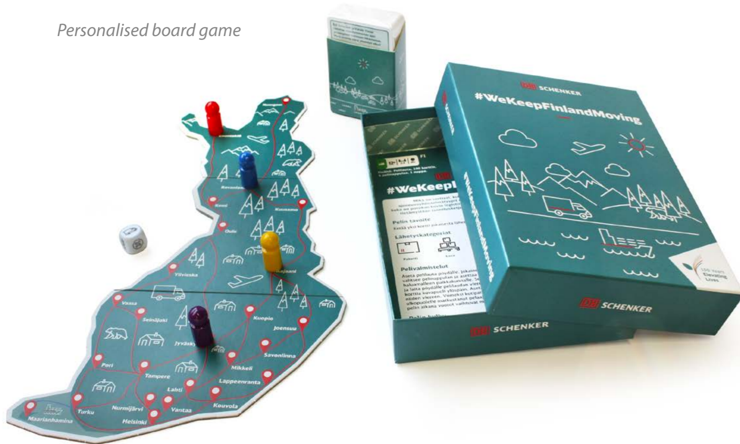
Personalised board game

Icebreaker and coaching games often contain text and picture cards, rules and a box. The games can be used to learn about the recognition of different emotions and think about how to process them. The cards can also contain tasks that promote e.g. linguistic skills.