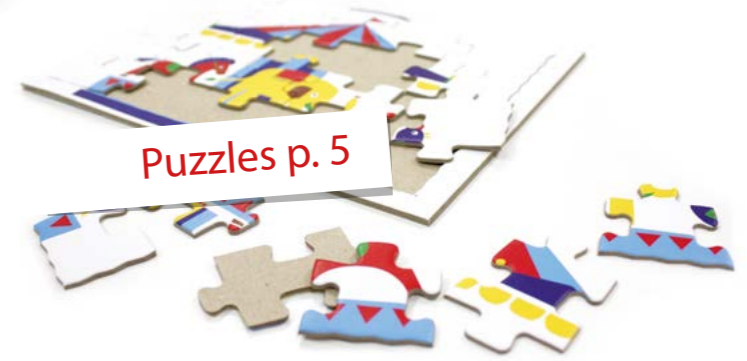
Puzzles p. 5