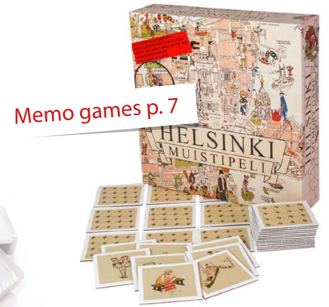
Memo games p. 7